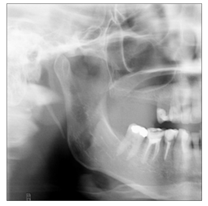
Figure 1. Preoperative panoramic radiograph before sinus grafting.

Implant placement and bone sample: After the healing graft period of 6 to 9 months a total of 119 implants Tissue level Straumann® (Dental Implant System, Straumann AG, Basel, Switzerland) and 3i Biomet<sup>®</sup> (Implant Innovations, Palm Beach Gardens, Florida, USA) were placed and 10 samples of the regenerated bone were collected for the histomorphometric analysis. The implant installation was carried out in local anesthesia. A paracrestal incision on the palate was connected with two vertical incisions that were positioned adjacent papilla to preserve it. The bone samples were harvested from 10 randomly selected patients using a 3 mm diameter trephine bur during the first drilling for implant placement, then the preparation was finalized according to the manufacturer's manual. The samples were submerged in 10% buffered formaldehyde and subsequently dehydrated in increasing alcohol concentrations. The implant healing period in the graft was 6 months. The fixed prosthetic treatment was accomplished according to the manufacturer's manual.