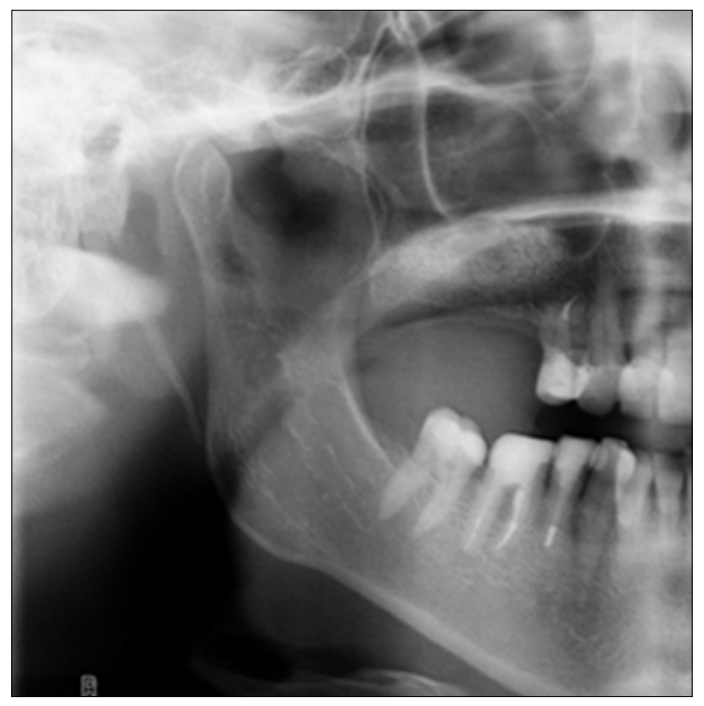
Figure 1a. Panoramic radiograph before implant installation and six months after sinus elevation.

Radiographic examination: The CBCT or panoramic X-rays were performed pre-surgically and before the implant placement to evaluate the bone formation (Figures 1 and 1a). Intraoral X-rays were accomplished six months after implant placement and then annually to asses marginal bone loss. The success rate was determined using the Albrektsson et al. criteria [18].